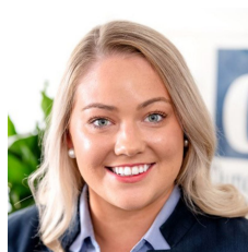
DCK Sales (03) 5440 5000

View : https://www.dck.com.au/sale/vic/greater-bendigo-region/north-bendigo/residential/house/5766706