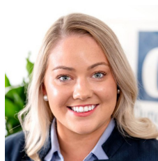
DCK Sales (03) 5440 5000

View : https://www.dck.com.au/sale/vic/greater-bendigo-region/california-gully/residential/house/5767680